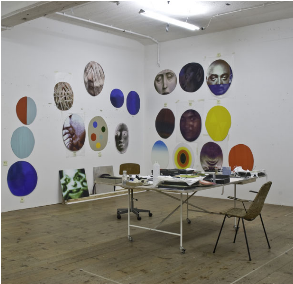
View of the artist' studio

From November 24th to January 14th, 2012