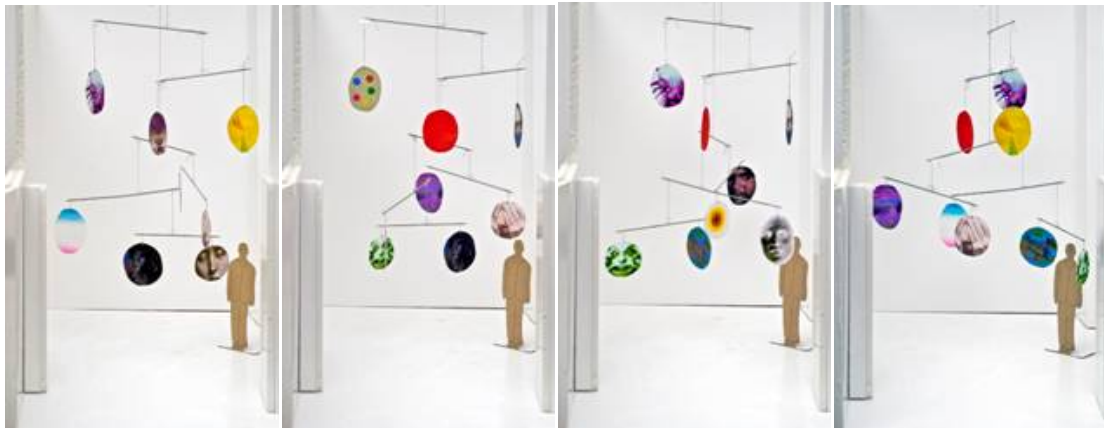
Some Studies for Figures at the Base of a ... (Model), 2011. 350 x 350 x 350 cms