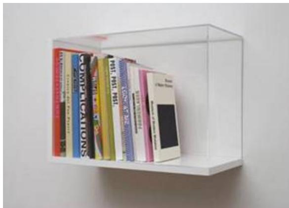
Die Auswahl / La Selección , 2010. Lithograph, wood and Plexiglas

ANNE BERNING (Werl, Germany 1958) had held individual shows at Kunsthalle in Bremerhaven, at Städtische Galerie Waldkraiburg, at CAC (Center of Contemporary Art) in Málaga, at Kuckei + Kuckei gallery in Berlin, at Grunt Gallery in Vancouver and has participated in distinguished collective shows such as “Io non ho paura del colore” at Villa Piccolomini de Roma, “Aldrei Nie Never” at Living Art Museum in Reykjavik, “Wonkenbilder” at Alte Nationalgalerie in Berlin, “Wie gemalt” at Städtische Galerie Neunkirchen, “Don” at Chianti Foundation in Texas, “Save the day” at the Museum of Modern Art in Frankfurt or “Die Orte der Kunst” at the Sprengel Museum in Hannover. She has also partaken in important art fairs such as ARCO in Madrid, Art Basel Miami Beach, Art Forum Berlin, SHContemporary in Shanghai or CIGE in Beijing.